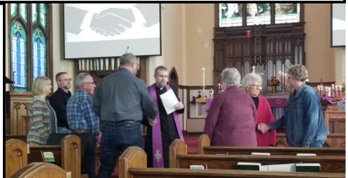
Installation of council members was held in February.